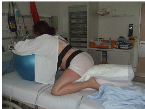
Figure 1. Two examples of hands and knees positions.

term ( \geq 37 weeks of gestation). We performed a transabdominal ultrasonography to reliably diagnose the fetal head position during the first stage of labour. The operator could be a doctor, a midwife or a research assistant. Each had personal skills in ultrasonography. In case of doubt, there was a double check. The position of the head was determined according to the position of the usual features of the face or the orientation of the midline and the position of the intracranial landmarks. After confirming the fetal head position, all women presenting a fetus in the OP position (including both left and right OP) were invited to participate in the trial. Women < 18 years old, with a limited understanding of French or who had attempted the hands and knees position previously during the first stage of labour were not enrolled in the study.